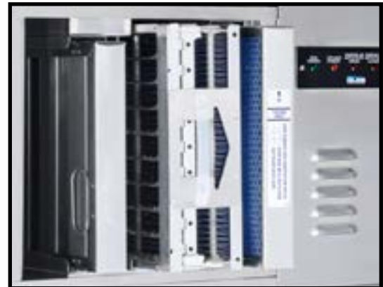
Ventless Hood System