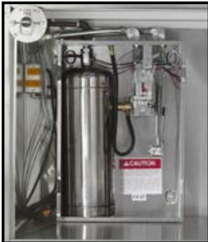
ANSUL canister inside base cabinet